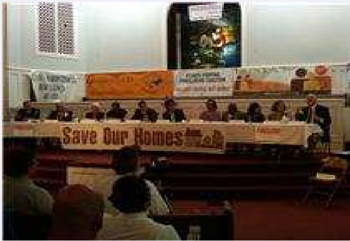
A panel of national and local leaders discuss Fulton County's foreclosure epidemic with Georgia residents.

“It is very clear how the foreclosure crisis has impacted communities – homeowners cannot get their home loans restructured so that they can stay in their homes, the banks foreclose, the homes are vacant and crime and blight result,” Eaves stated. “For county government which collects the taxes, foreclosures mean prop-